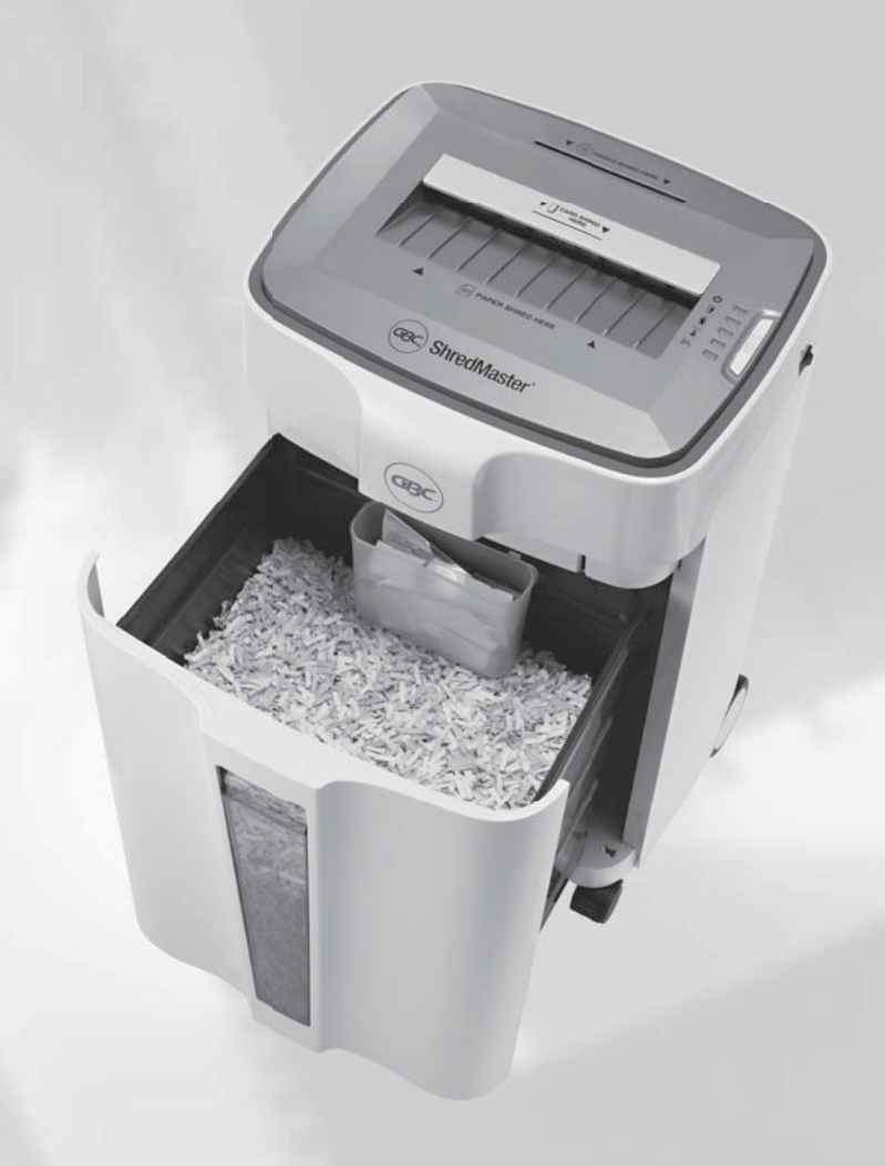
Shredmaster 31SX/33SM/35SX Instruction Manual